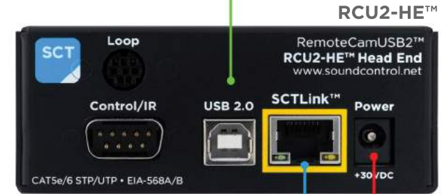
SCTLink™ Cable Power, Control & Video

The SCTLink™ cable must always be a single, point-to-point CAT cable with no couplers or interconnections.