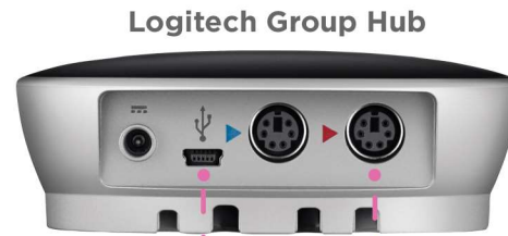
Logitech Group Speakerphone Logitech Cable 993-001137