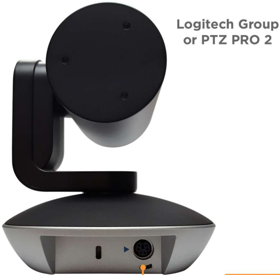
Logitech Group or PTZ PRO 2

RCU2S-HE™ Front Panel Field-Upgradeable microSD Slot