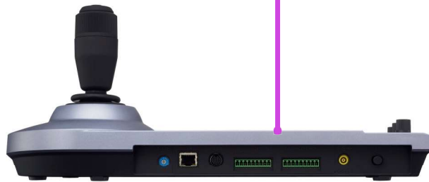
Sony IP10/RMBR300 or Generic RS232 Controller