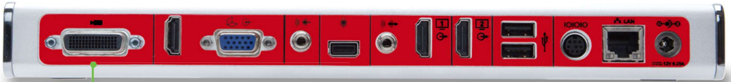
Poly RPG300, RPG500, RPG700 & G7500