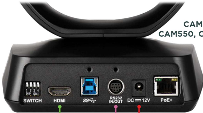
AVer CAM520 Pro Advanced, CAM550, CAM570, MD120U & TR535