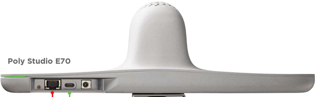
Poly Studio E70

RCC-M005-0.3M USB-A (RCU2S-CE™) to USB-C