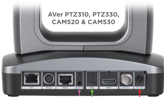
AVer PTZ310, PTZ330, CAM520 & CAM530