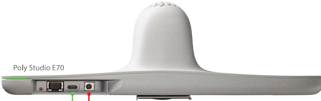
Poly Studio E70

RCC-M005-0.3M USB-A (RCU2S-CE™) to USB-C