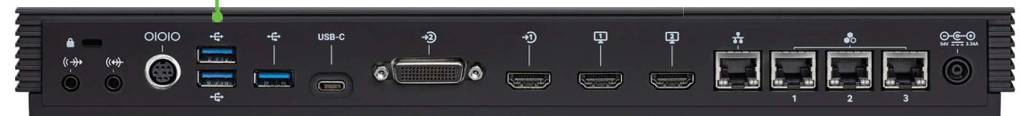
Poly G7500 & G62

RCC-M004-1.0M USB-B (RCU2S-HE™) to USB-A