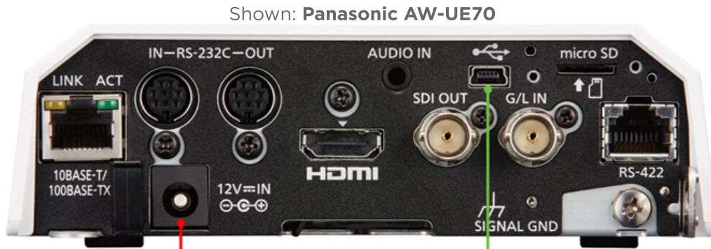
Shown: Panasonic AW-UE70