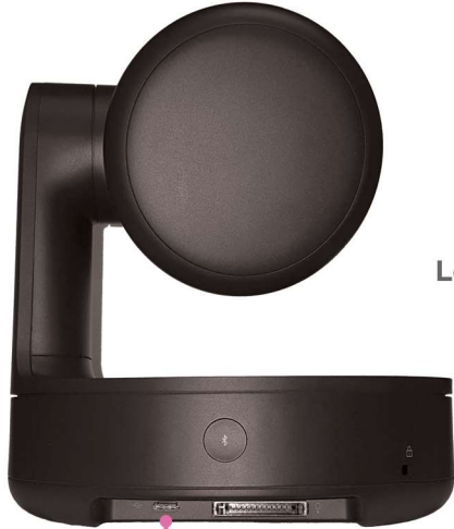
Logitech Rally Camera