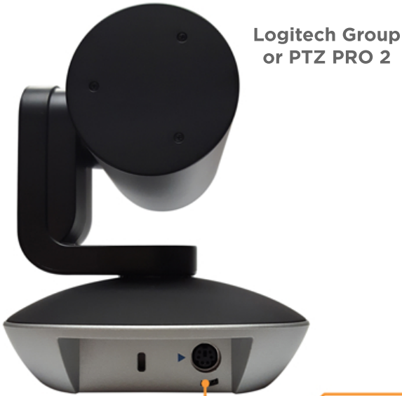
Logitech Group or PTZ PRO 2