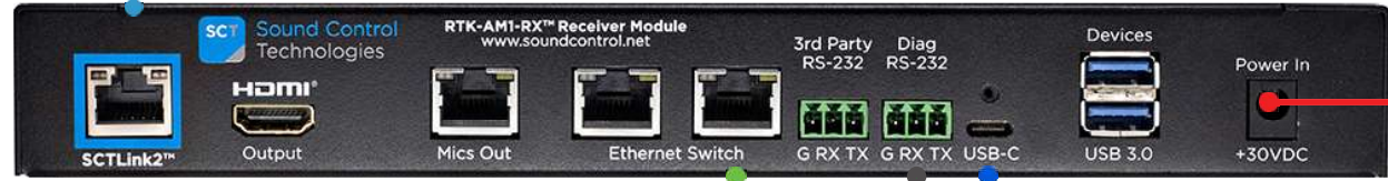
WPS-12 30VDC 100-240V 47-63Hz Power Supply