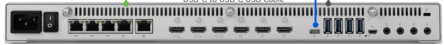
Cisco Codec EQ, Room Bar & Room Bar Pro

*SCTLink2™ Cable Specs Integrator-Supplied CAT6A U/FTP Cable EIA568A or EIA568B (10m-100m min/max Length)