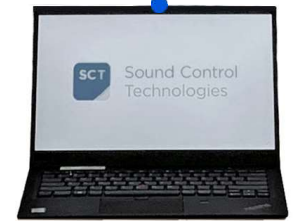
RCC-M015-2.0M USB-C to USB-C USB Cable