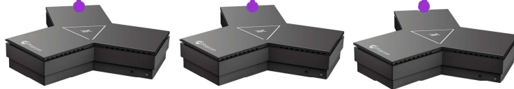
*Cables Included with Poly IP Table Microphone and TC8/TC10