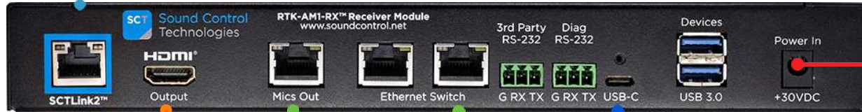
RCC-M015-1.0M HDMI to HDMI Cable