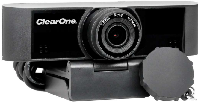
ClearOne Supplied Cable