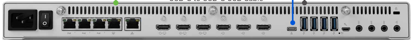
Cisco Codec EQ, Room Bar & Room Bar Pro

Note: DIP switch position 1 on the Receiver must be in the on position to enable Cisco communications.