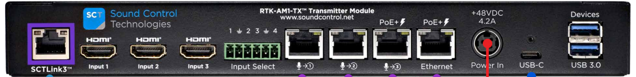
RTK-AM1™ Transmitter Module