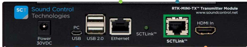
RTK-MINI-TX™ Transmitter Module

RCC-M006-2.0M USB Micro-B (RTK-MINI-TX™) to USB-A