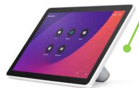
Cisco Navigator or Touch 10

The SCTLink™ cable must always be a single, point-to-point CAT cable with no couplers or interconnections.