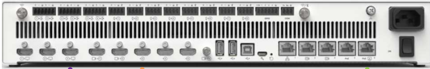
Cisco Codec Pro

RCC-M005-1.0M USB-A (RTK-MINI-RX™) to USB-C (Capture Device)