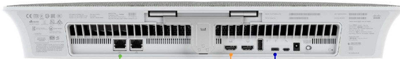
Cisco Room USB [Room Kit Mini]

RCC-H016-1.0M RJ45 to RJ45 UTP Control Cable