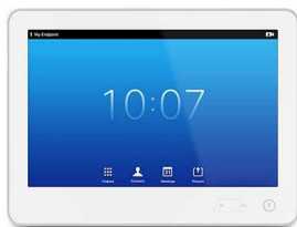
Cisco Touch10 or Navigator Ethernet/POE *Cisco Provided*

RCC-H016-1.0M RJ45 to RJ45 UTP Control Cable