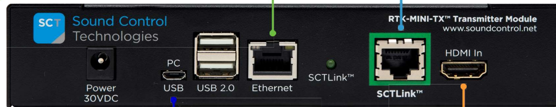
RTK-MINI-TX™ Transmitter Module

RCC-M006-2.0M USB Micro B (RTK-MINI-TX™) to USB-A