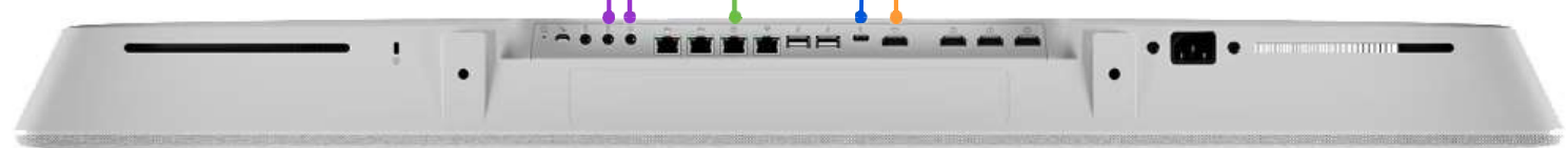
Cisco Webex Room Bar Pro

RCC-M005-1.0M USB-A to USB-C *Purchased Separately