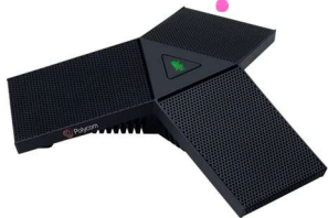
Poly Expansion Mic