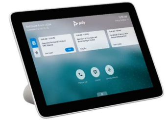
Poly TC8 & TC10 *Poly Provided*